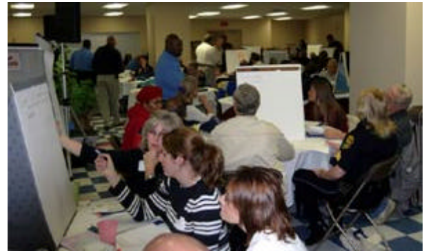
Conference attendees agonize over "Problem Identification" as relates to menu choices (Hot dog, hamburger, or both?)