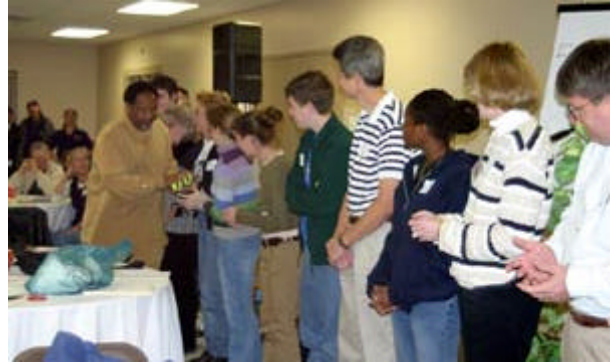
Learning how to "pass the buck" at Neighborhoods Conference