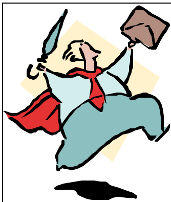
CNC MAN , SUPERHERO!